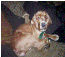
Faith Puppy Mill Dog #1 December 2006